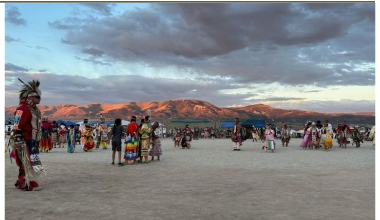
We were honored to join the 2023 Ely Shoshone Tribe's Fandango Pow Wow

Our goal is to gain a better understanding of and respect for any cultural traditions and/or values tribes may have for land associated with the project, provide project updates, and understand how the tribes would like to be involved as development progresses. We are also speaking to interested tribes about potential economic development opportunities including federally funded programs.