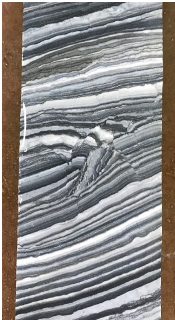
Drill Core of Li-B Searlesite Ore from Rhyolite Ridge

With the U.S. Department of Energy's support and a fully permitted project, Rhyolite Ridge is on track to become a cornerstone of the nation's secure and domestic battery supply chain. The project is expected to power an estimated 370,000 electric vehicles per year, creating hundreds of local jobs and contributing substantial revenues to local and state governments for decades.